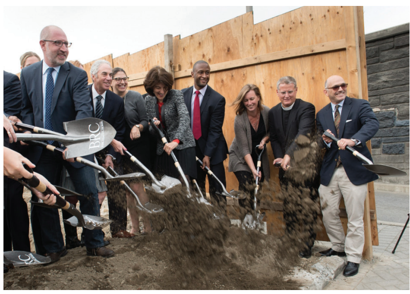
Breaking Ground for Homeless Shelter and Affordable Housing, New York City, September 2015

Trinity's work around housing and homelessness ranges from engaging on housing policy to funding and developing lowincome housing. Trinity seeks to be an example for others: both an advocate for action and an action taker.