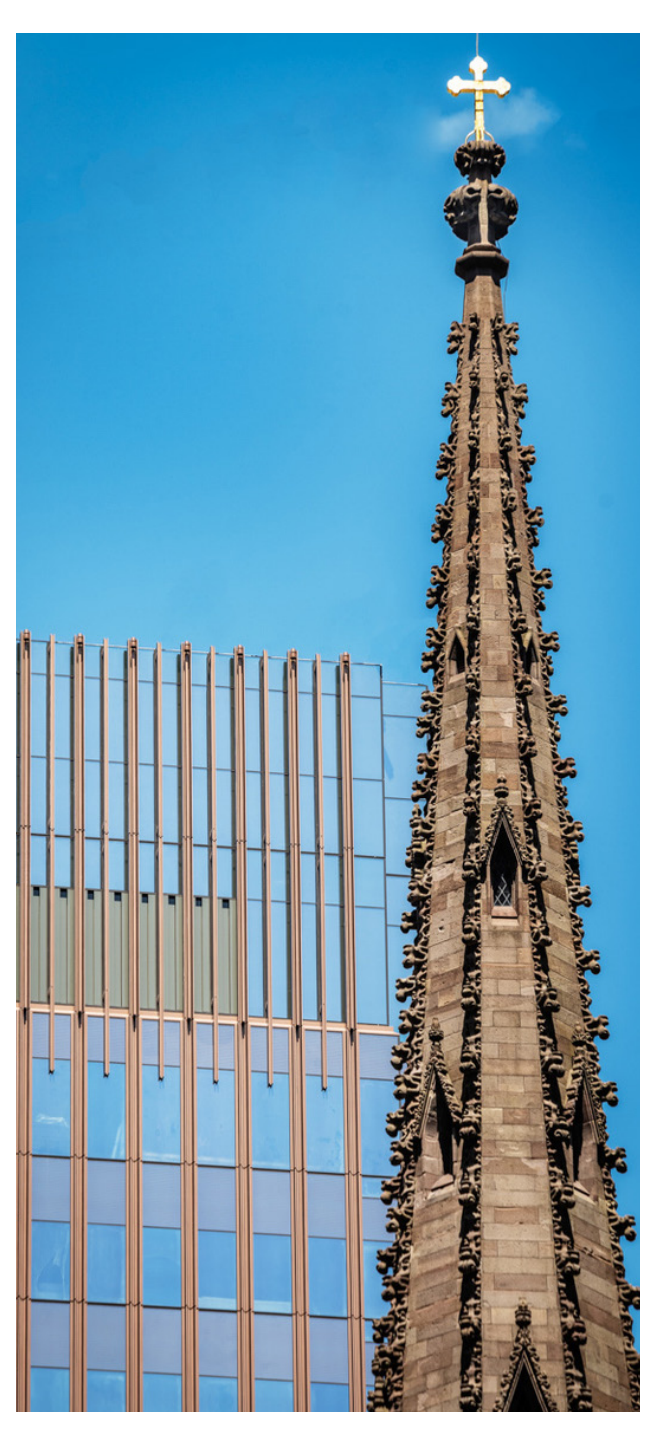
2019 Trinity Church and Trinity Commons

Trinity is building a new parish and community center, Trinity Commons, which will open in the spring of 2020. Trinity Commons creates a "spiritual family room" and a sense of community for our growing, evolving lower Manhattan neighborhood. The building is a beacon for the neighborhood and the physical manifestation of our core values, inviting and welcoming all, from church members to those who may have no connection to Trinity at all. Trinity Commons is energetic, active, and lively, with flexible space and varied programming that serves a wide variety of audiences. It is a place of rest and refreshment, both spiritual and physical, that encourages people to linger and to return.