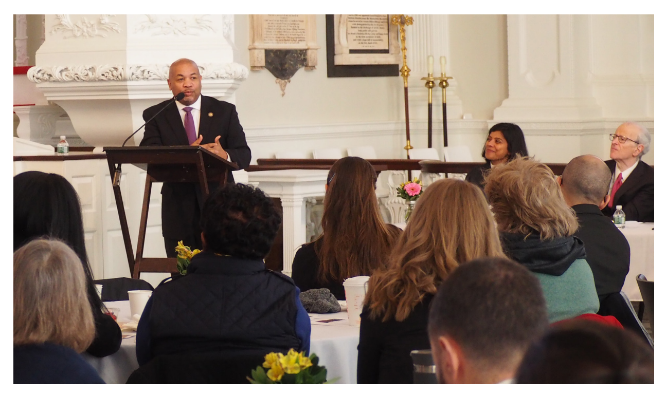
Mass Bail Out Breakfast at St. Paul's Chapel, January 2019