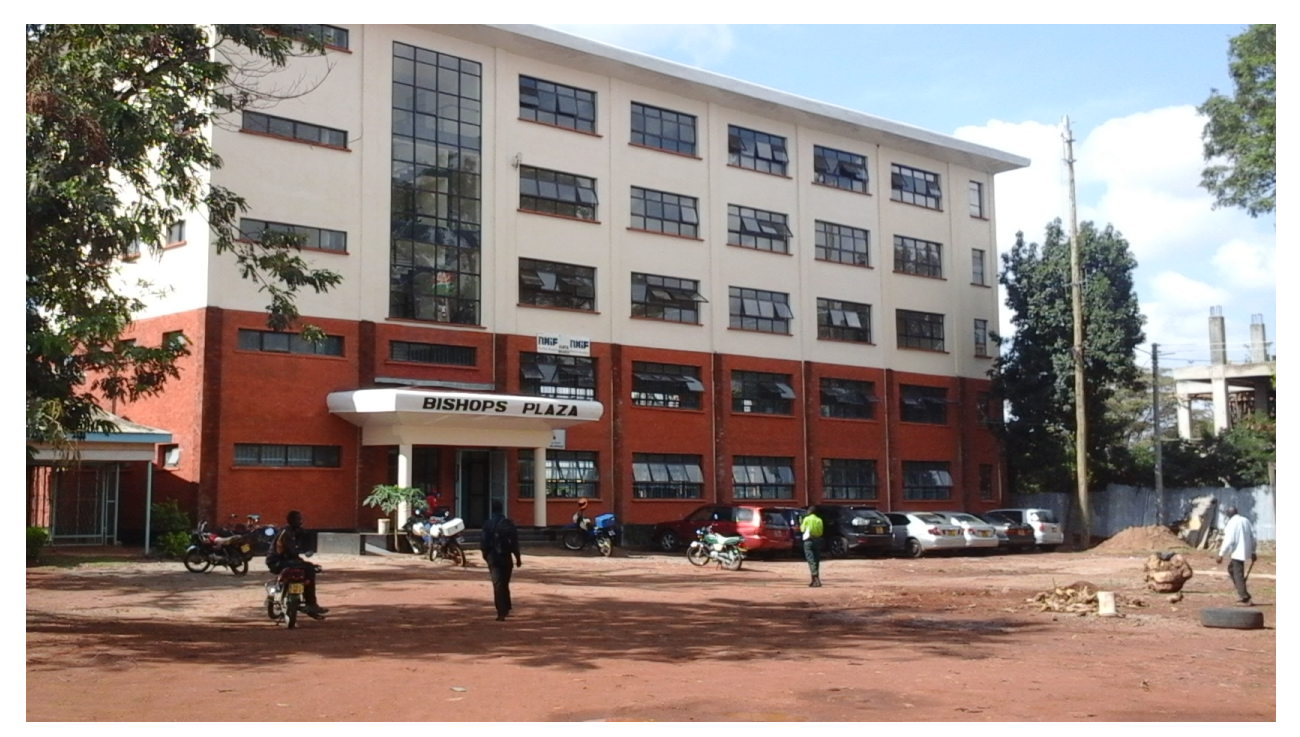
Diocese of Maseno West, Kenya commercial building

Trinity promotes "mission through marketplace," the concept that effective, long-term mission can be developed, sustained, and expanded using the tools of the marketplace. Our aim is to help our partners—churches and other organizations—to plan and deliver financial projects that align with their core values for the purpose of sustaining mission.