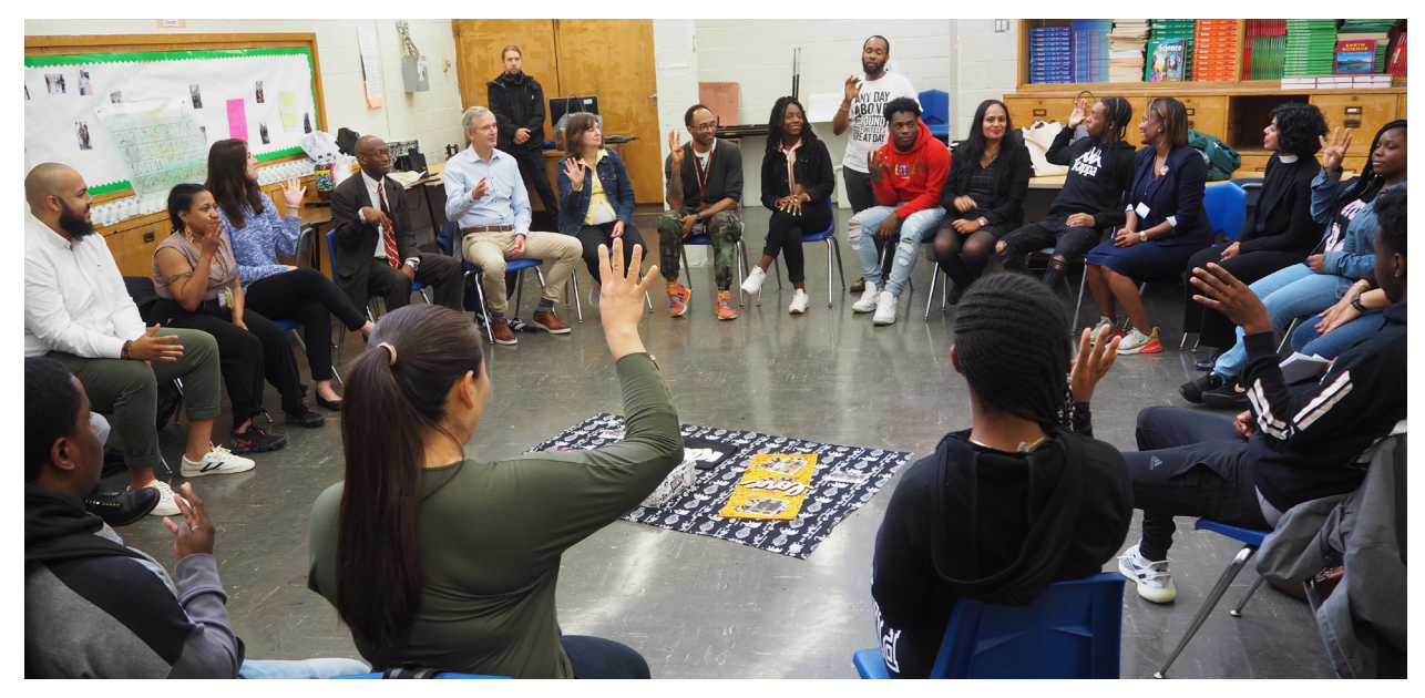
KAVI, Kings Against Violence Initiative, June 2019

The U.S. is the world's leader in incarceration, bolstered by an overly punitive criminal legal system deeply rooted in racism that has unfortunately failed to produce justice, or account for harm and trauma. New York City is a national leader in moving away from mass incarceration, but over-incarceration and racial disparities persist. Trinity Church, with a gospel calling to engage and a longstanding involvement in racial justice efforts, will build on successes, address persistent challenges, and make racial justice a reality in New York City by ending mass incarceration.