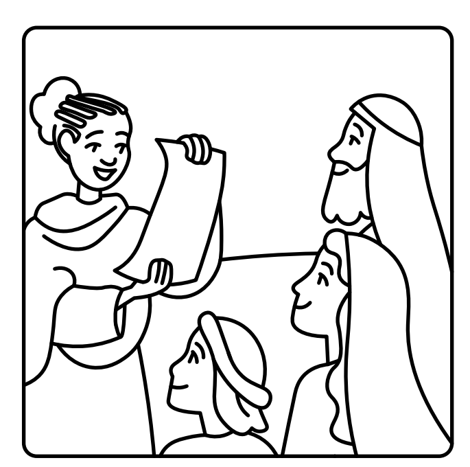
4. The church leader tells this community life will not always be hard and reminds them to share these difficult things with God. God will support them, help them feel good again, and make sure they are safe and sound.