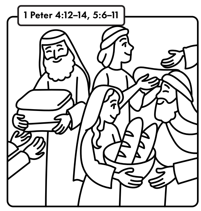
1. After Jesus died, came back to life, and went to be with God, people shared Jesus' story and tried to live in the ways Jesus taught them. They worked to share God's love and serve others.