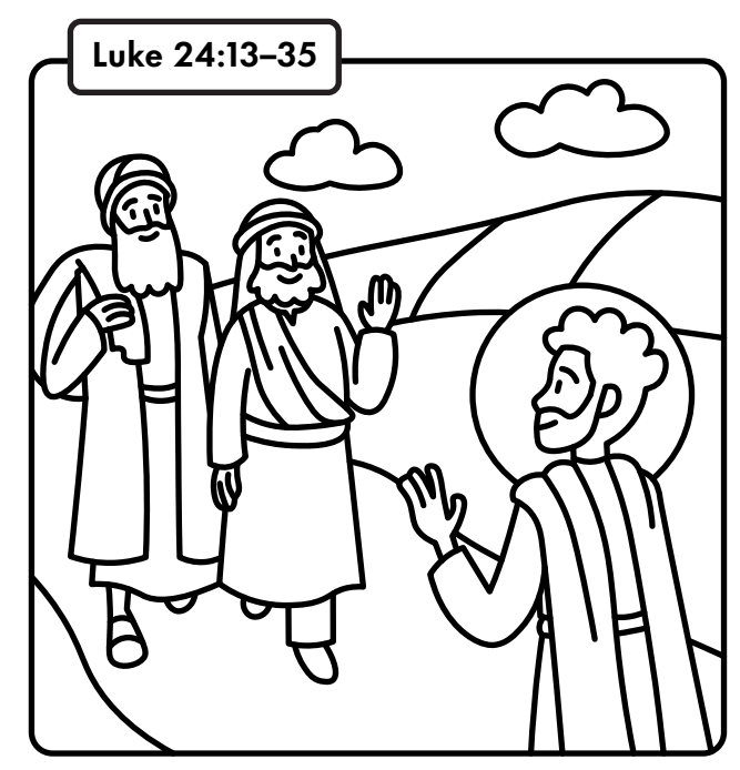
1. Two travelers were walking to Emmaus, a town near Jerusalem, discussing what had happened to Jesus. Jesus himself came up to them, but he hid the truth of who he was. He asked them, "What are you talking about?"