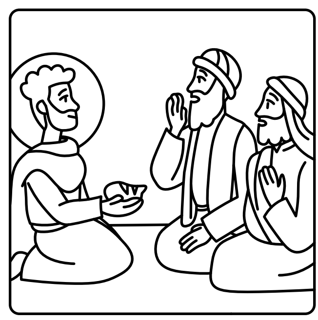
4. He then taught them many lessons from scripture. As they arrived in Emmaus, the travelers asked Jesus to eat with them. When Jesus blessed the bread, they suddenly recognized him! Later, the travelers excitedly told the disciples what had happened.