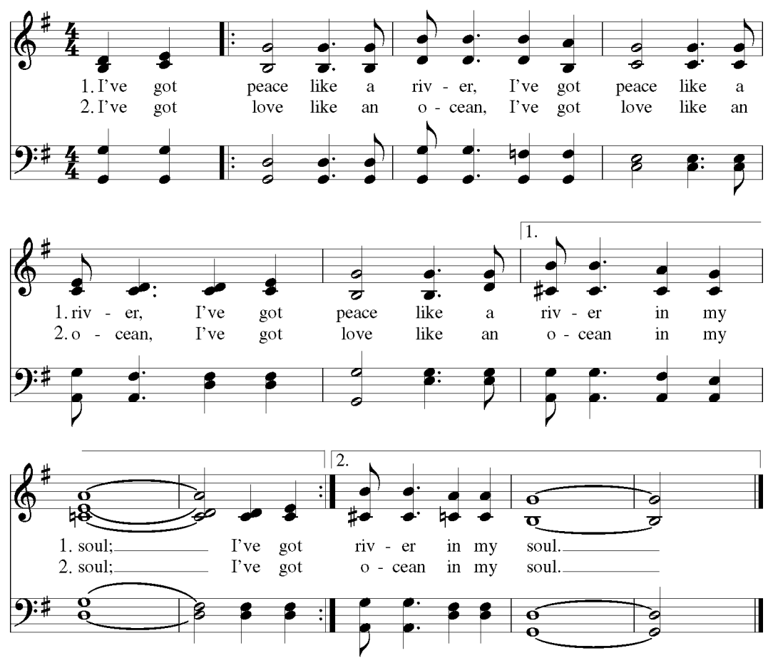
Words: Traditional; Music: Spiritual