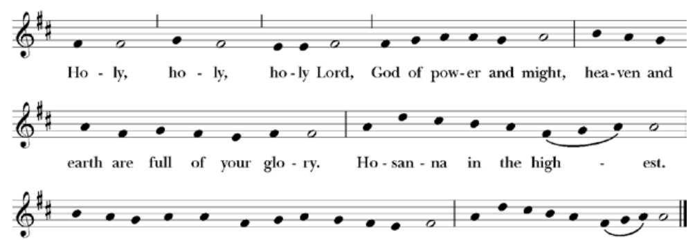
Bless'd is the One who comes in the name of the Lord. Ho-san-na in the high - est.