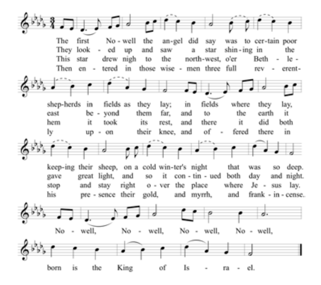
Words: English Carol, 18th cent. Music: The First Nowell, English carol, 17th cent