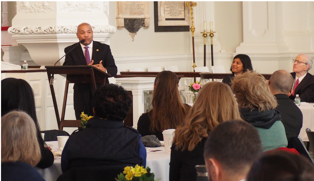
Mass Bail Out Breakfast at St. Paul's Chapel, January 2019