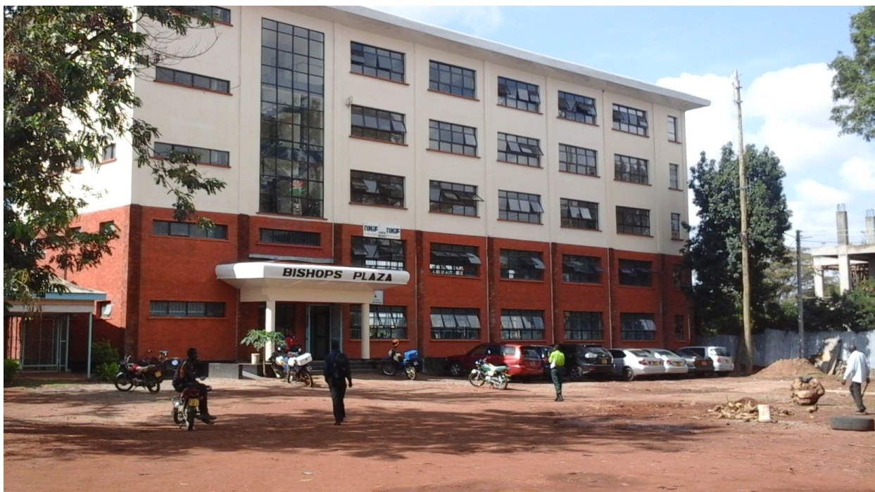
Diocese of Maseno West, Kenya commercial building

Trinity promotes “mission through marketplace,” the concept that effective, long-term mission can be developed, sustained, and expanded using the tools of the marketplace. Our aim is to help our partners—churches and other organizations—to plan and deliver financial projects that align with their core values for the purpose of sustaining mission.