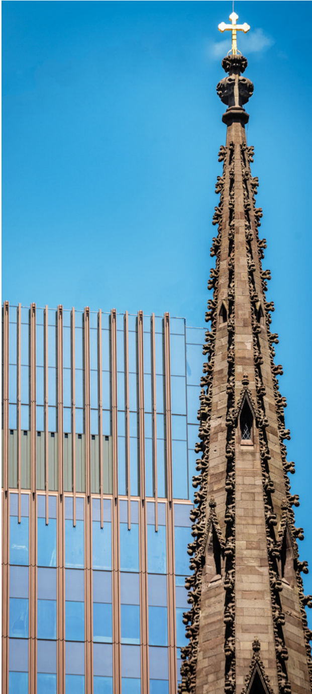
2019 Trinity Church and Trinity Commons

Trinity is building a new parish and community center, Trinity Commons, which will open in the spring of 2020. Trinity Commons creates a “spiritual family room” and a sense of community for our growing, evolving lower Manhattan neighborhood. The building is a beacon for the neighborhood and the physical manifestation of our core values, inviting and welcoming all, from church members to those who may have no connection to Trinity at all. Trinity Commons is energetic, active, and lively, with flexible space and varied programming that serves a wide variety of audiences. It is a place of rest and refreshment, both spiritual and physical, that encourages people to linger and to return.