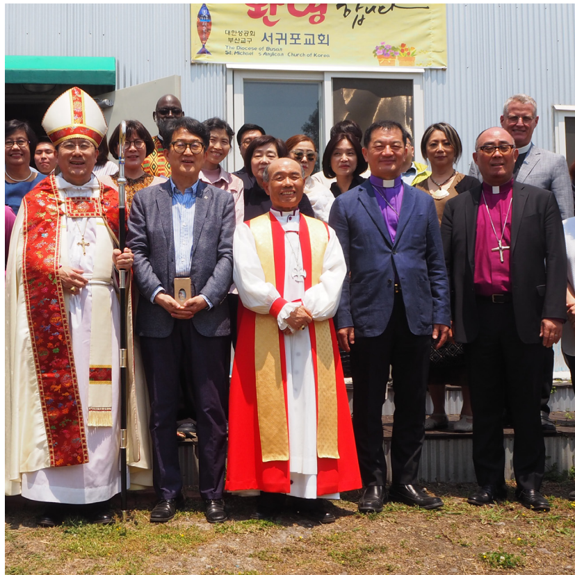
Asian Primates Retreat, South Korea, 2019 Korea

Trinity organizes convocations, digital communities, and other forms of ongoing communication to build a vibrant global network of peer learning and shared values.