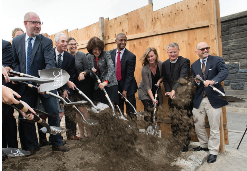
Breaking Ground for Homeless Shelter and Affordable Housing, New York City, September 2015

Trinity has a gospel calling and a moral obligation to engage on homelessness and affordable housing. Trinity has direct experience in housing including building and operating St. Margaret's House and funding organizations in New York City that are addressing these issues. While Trinity's resources are great, they are not enough to solve this issue. Trinity will continue to seek partnerships with government, foundations, real estate and other churches and faith groups to work to alleviate homelessness and provide affordable housing to the residents of New York City.