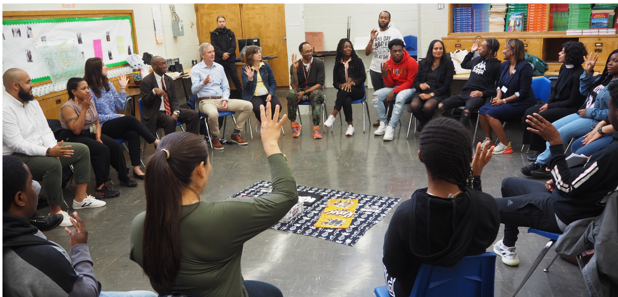
KAVI, Kings Against Violence Initiative, June 2019

The U.S. is the world's leader in incarceration, bolstered by an overly punitive criminal legal system deeply rooted in racism that has unfortunately failed to produce justice, or account for harm and trauma. New York City is a national leader in moving away from mass incarceration, but over-incarceration and racial disparities persist. Trinity Church, with a gospel calling to engage and a longstanding involvement in racial justice efforts, will build on successes, address persistent challenges, and make racial justice a reality in New York City by ending mass incarceration.