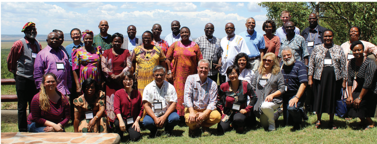
Leadership Meeting, Nairobi, Kenya, February 2019